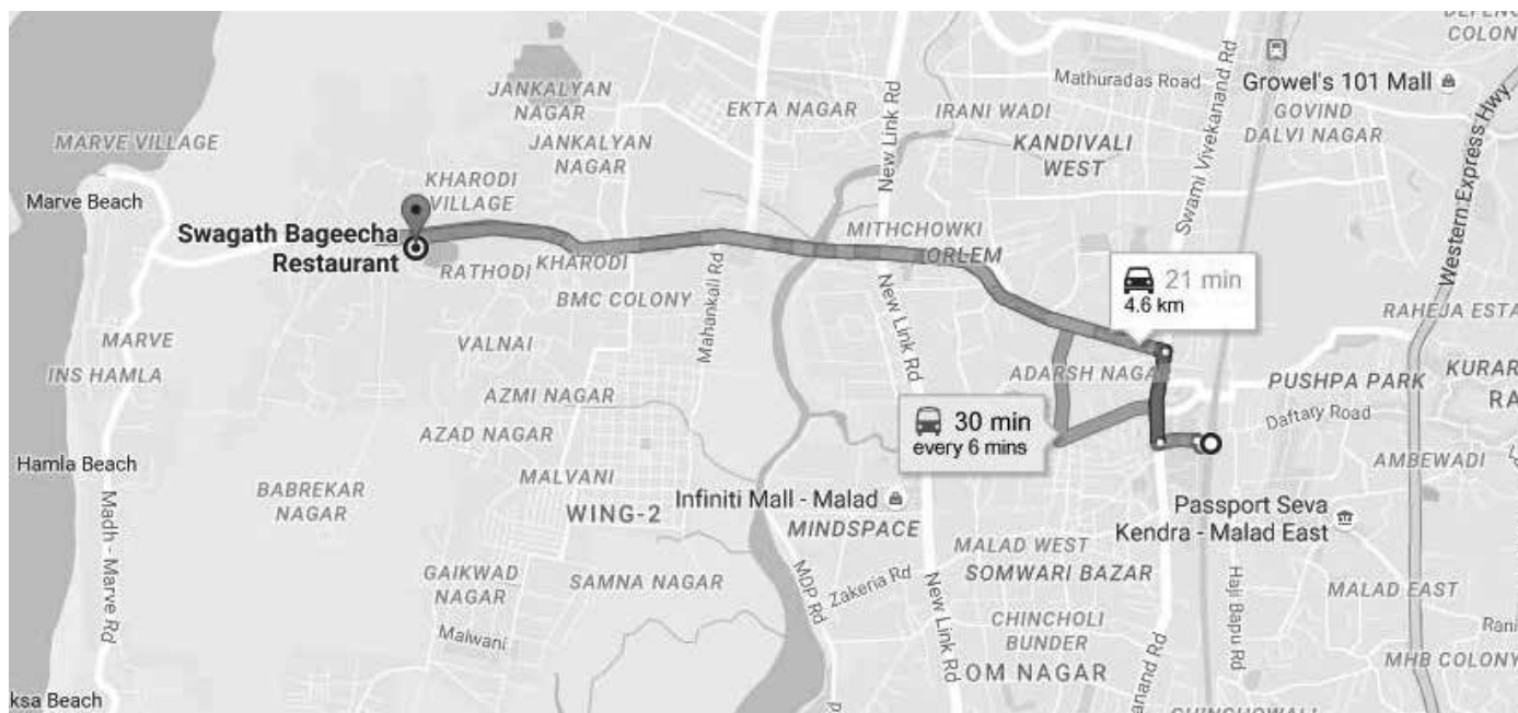
Route Map for Venue of 29 th Annual General Meeting of BDH Industries Limited

Nair Baug, Akurli Road, Kandivli (East), Mumbai 400101 Tel. No.:022-61551234 Fax No.: 022-28868349 Email – investors@bdhind.com Website : www.bdhind.com CIN – L24100MH1990PLC059299